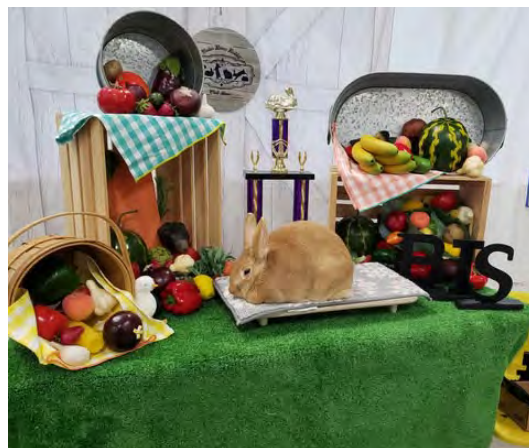
Riley Ratliff Best in Show Cedar River Rabbit Club Golden 6/8 Doe