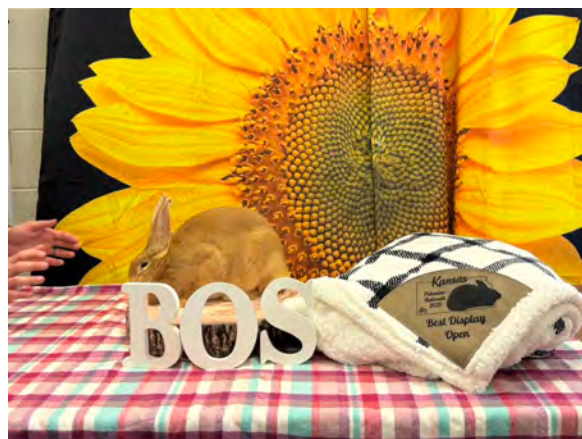
Best Opposite of Breed Best Opposite of Variety Golden 6/8 Doe Cody Gallagher