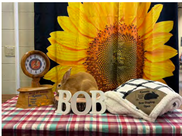
Best of Breed Best of Variety Golden Jr Buck Cody Gallagher