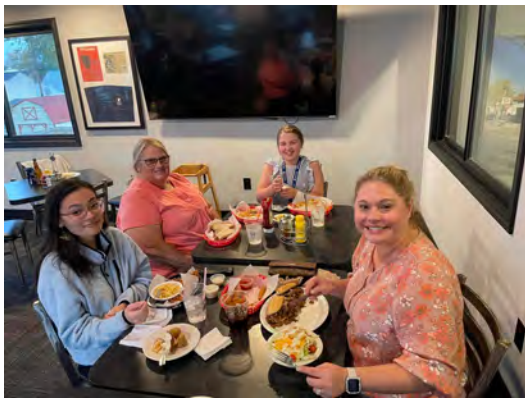
Pal Dinner Check's Cafe