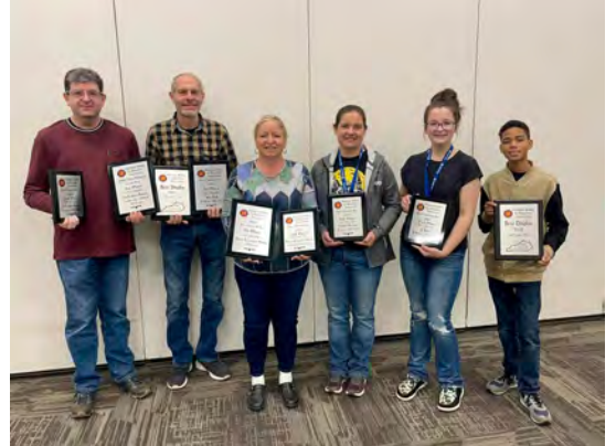
Sweepstakes Winners in Attendance